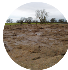
Slurry store pre-treatment with Digest-it ®