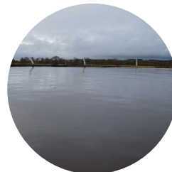
Slurry store three months post-treatment with Digest-it ® (after a short agitation)